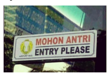
Picture 1. An Example of Incorrect Translation (Instagram: @xmadeofstonex)

international visitors will be at risk of misunderstanding tourism information. The example can be seen from the picture below: